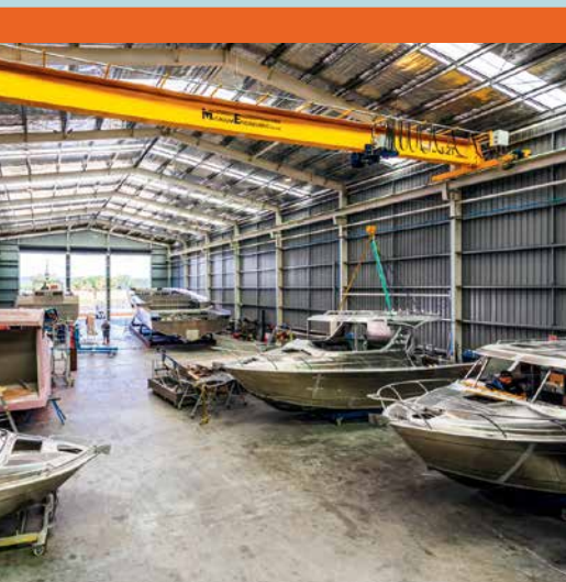
LEFT The new facility is specifically geared to the building of large sportsfishers and commercial vessels.